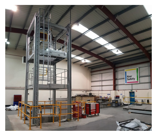
Kee Safety's Testing Center at Global Headquarters in Cradley Heath, UK.

KeeLine® has been tested in every scenario on built roofs, both dynamically and statically. Our thorough and consistent tests have been independently witnessed and exceed requirements of OSHA standards and related guidelines. Overall, KeeLine® provides compliance, functionality and competitive pricing.